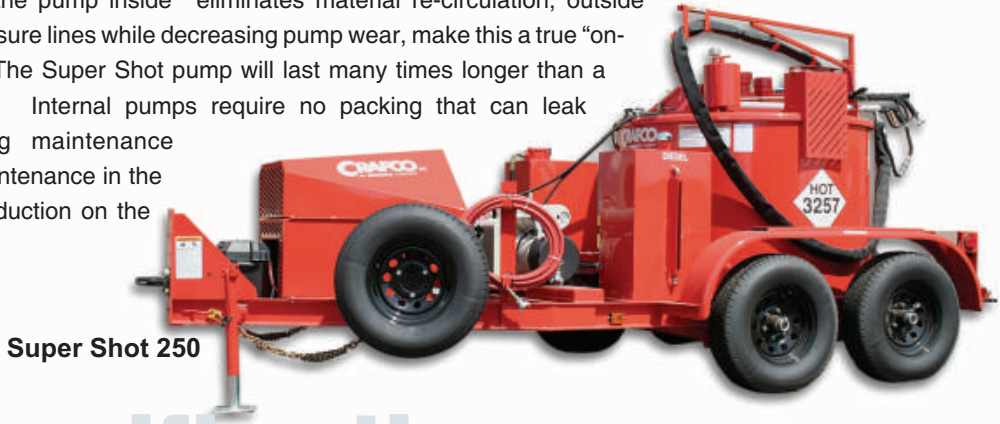
Super Shot 250

The patented pump technology of the Crafcro Super Shot melters is what makes the Super Shot the most productive and lowest maintenance melter in the industry. The Crafcro patented pump is mounted inside the melter. Mounting the pump inside eliminates material re-circulation, outside plumbing, high-pressure lines while decreasing pump wear, make this a true "on-demand" system. The Super Shot pump will last many times longer than a conventional pump. Internal pumps require no packing that can leak eliminating packing maintenance resulting in less maintenance in the shop and more production on the job.