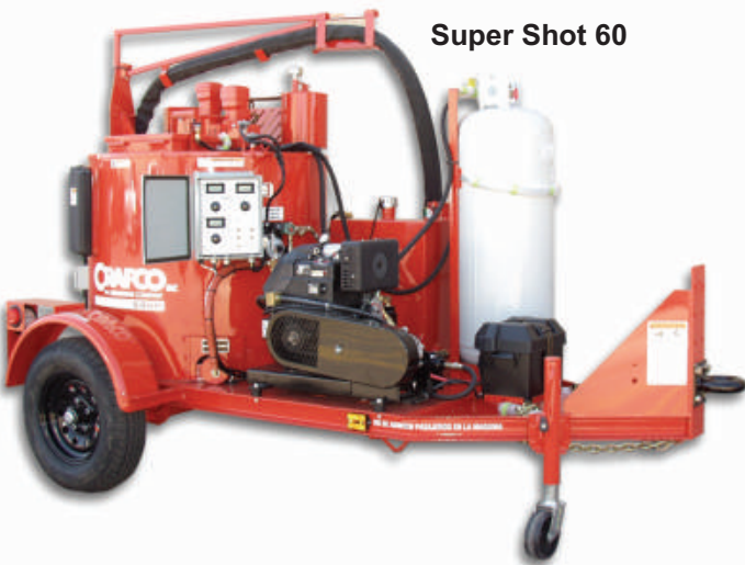
Super Shot 60

Items not indicated: Safety Chains, Breakaway Switch, Light Board, Fire Extinguisher, Auto Shut Off, Safety Manual, and Autoloader.