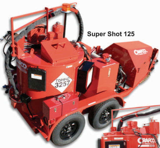
Super Shot 125